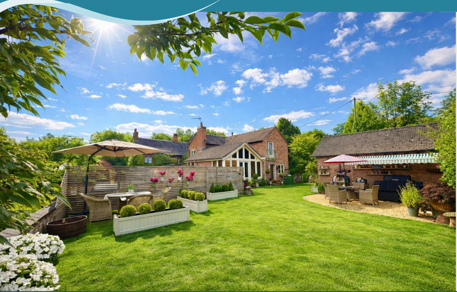
'MILL COTTAGE' | SALFORD | AUDLEM | CHESHIRE | CW3 0BJ | OIRO £665,000