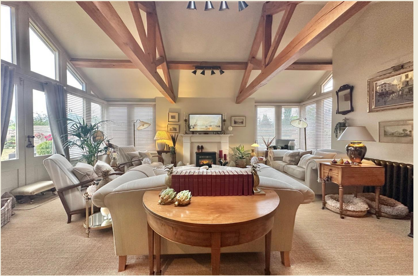
OPEN PLAN KITCHEN DINING LIVING ROOM:-