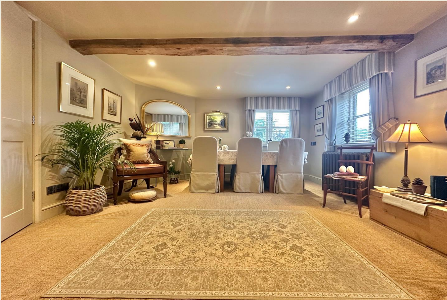
FORMAL DINING ROOM 13'5" x 11'10"