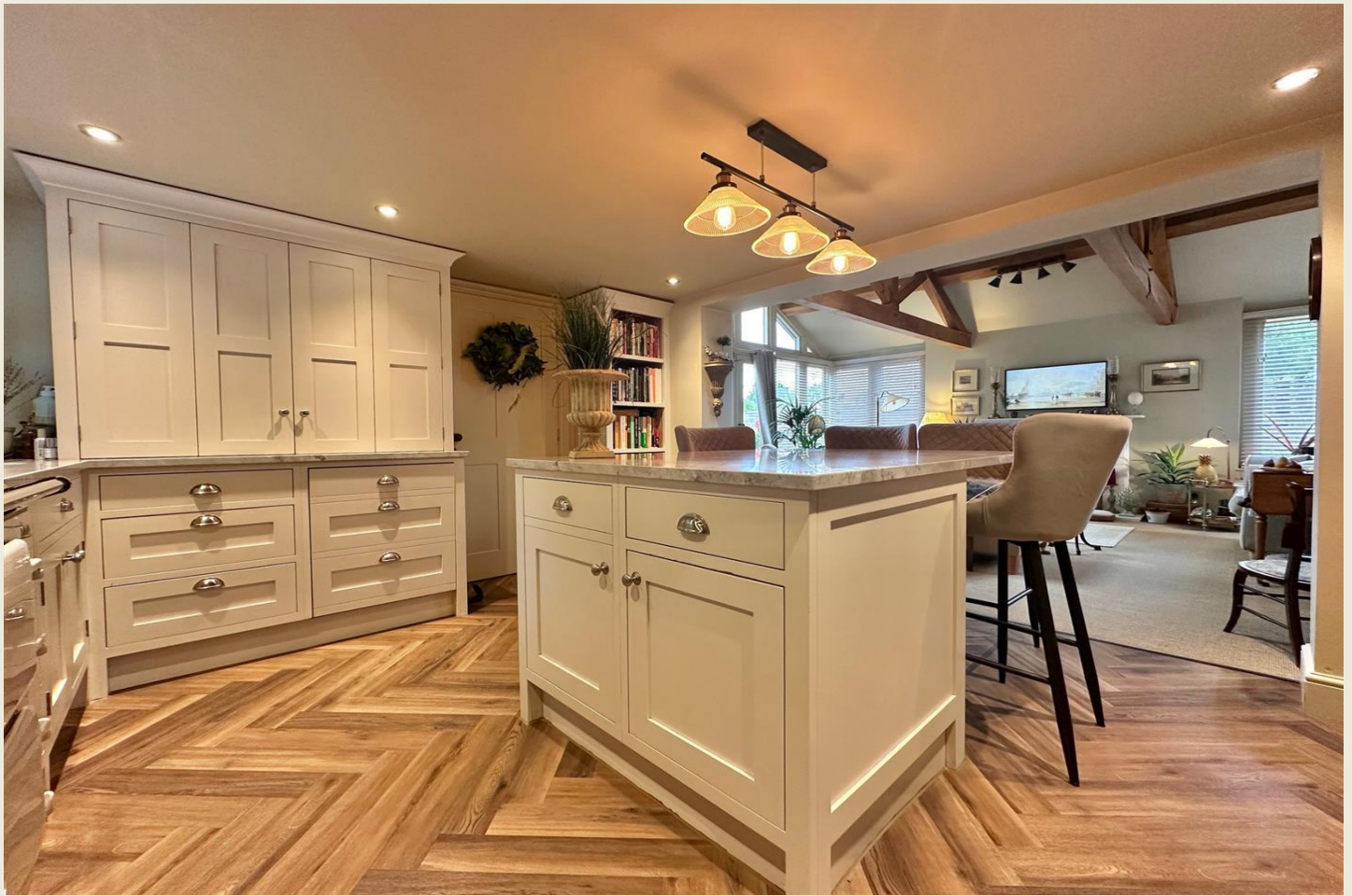
KITCHEN DINER 11'6" x 14'5"