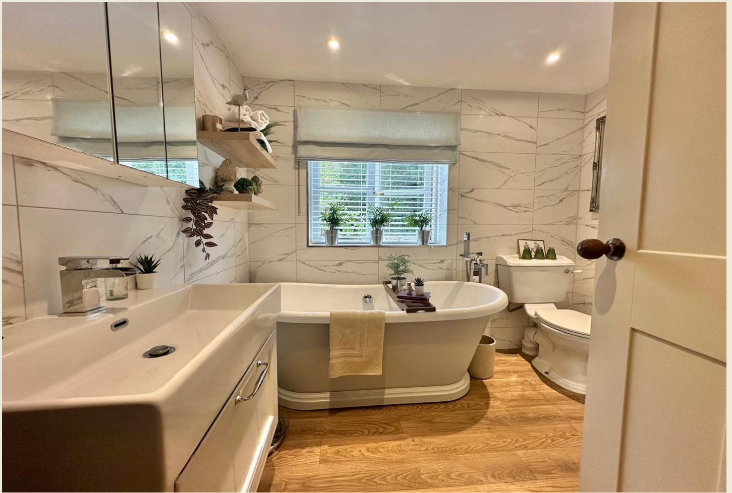
LUXURIOUS BATH & SHOWER ROOM 6'11" x 8'2"