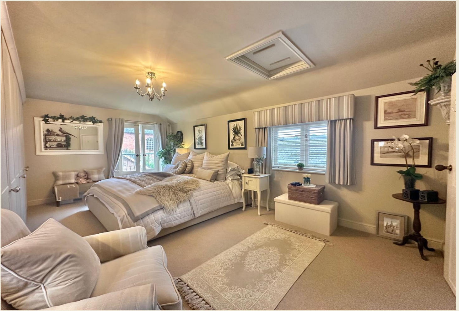
BEDROOM ONE 11'10" x 18'1"