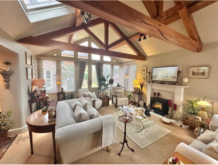
LIVING ROOM 14'9" x 18'8"