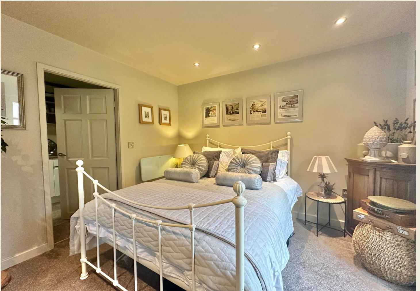
BEDROOM / OFFICE / LEISURE ROOM 11'2" x 10'2"